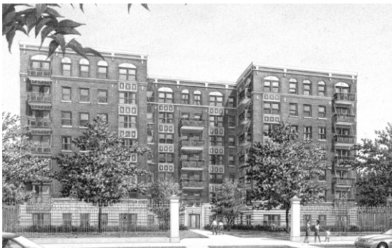
4537 S. DREXEL BLVD.

While Sutherland Pearsall has mainly been in the news for their substantial involvement in the renaissance of the South Side, this “nimble” group, as